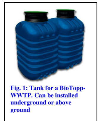
Fig. 1: Tank for a BioTopp-WWTP. Can be installed underground or above ground

For testing purposes the plant can be run in different modes. Carbon degradation, nitrification, denitrification as well as biological phosphorus removal can be implemented into the process by modifying the program. The BioTopp waste water treatment plant is the very first plant on market that can remove phosphorus biologically without adding any precipitation or flocculation agents. By adding biochar or activated carbon to the reactor additionally micro pollutants can be bound and be eliminated from the water. As an additional step the water can also be sanitized afterwards. Therefore an extra tank will be necessary. This would be filled with the cleaned waste water and equipped with a membrane. A pump sucks the water through the membrane which then can be reused for irrigation, cleaning or toilet flushing purposes.